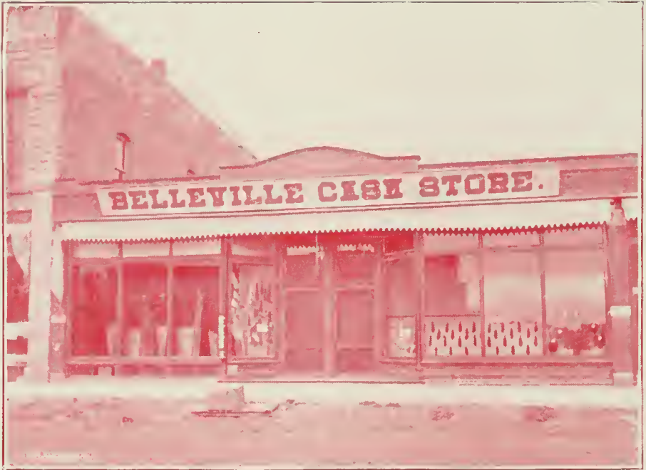
Belleville Cash Store, Loomis & Hollandsworth, Proprietors.